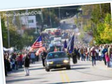
Sister Bay Fall Fest Parade

Named for the Sister Islands that guard its harbor entrance, Sister Bay has the largest public waterfront in